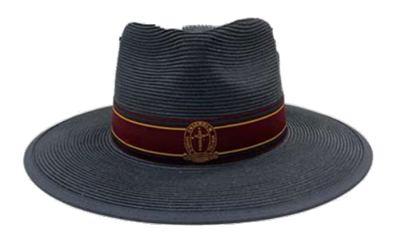
Formal Hat – Unisex Various sizes available.